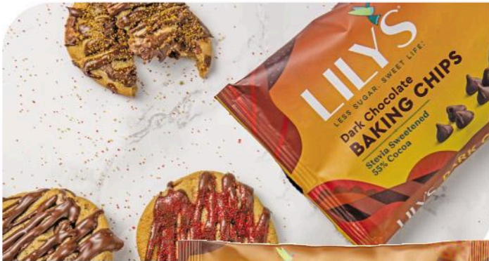
Lily's Sweets Baking Chips

"Winter is the time for comfort, for good food and warmth, for the touch of a friendly hand and for a talk beside the fire: it is the time for home." - Edith Sitwell