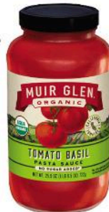
Muir Glen Organic Pasta Sauce (selected varieties)