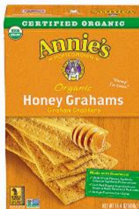
Annie's Organic Graham Crackers (selected varieties)