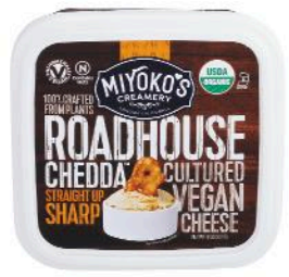
Miyoko's Organic Vegan Roadhouse Cheese Spread (selected varieties)