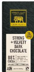
Endangered Species Chocolate Bar