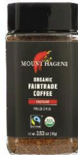
Mount Hagen Organic Instant Coffee