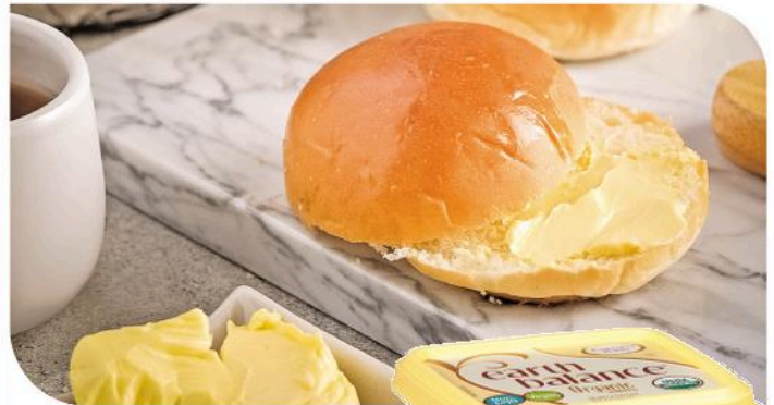
Earth Balance Organic Vegan Whipped Buttery Spread