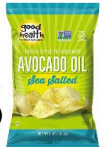
Good Health Avocado Oil Potato Chips