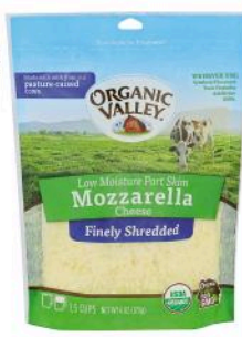
Organic Valley Organic Shredded Cheese (selected varieties)